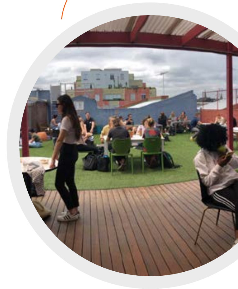
SSNT Fitzroy Rooftop alive with students.

“ I think that herbal medicine, how we use our plants and resources from nature to actually impact and improve our health is such an amazing science and we are so privileged to be a part of it and contribute to new knowledge. Integrative medicine is so important now with where we're going to. People often use holistic medicine with mainstream medicine and there is a place for both. We are the profession and the medicine of the future – of that there is no question. We are proud to be continuing the legacy.”